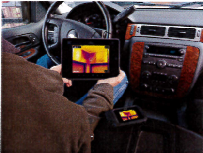
Upload images to FLIR Tools over Wi-Fi